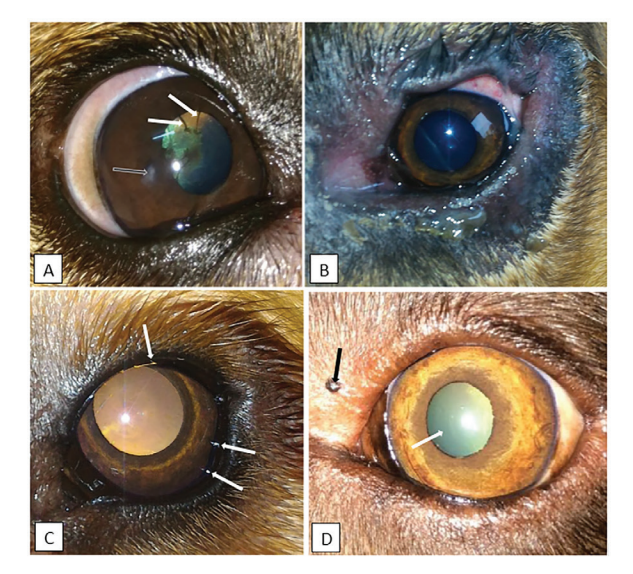
Fig. 1. Photographs of some of the ophthalmic abnormalities found in working dogs. A: Pupillary persistent membrane (white arrow) and corneal opacity (black arrow) in a 4-year-old male Belgian Malinois. B: blepharitis in a 1-year-old female Bloodhound. C: distichiasis (white arrows) in a 1-year-old female Golden Retriever. D: pigmented palpebral nodule (black arrow) and nuclear sclerosis (white arrow) in a 8-year-old female Labrador Retriever.

were found to have no refractive error (0 diopters) and only two dogs were found to have no refractive error in both the eyes. Of the 62 dogs, only 12 (19%) were considered emmetropes, in which five of them were Labrador Retrievers. The other 50 dogs were ametropic (81%), of them 40 (65%) were myopics and 10 (16%) hyperopics. Only three dogs (0.05%) were anisometropic (two Belgian Malinois and one Labrador Retriever), with a difference of 1.0 diopter between the eyes. A histogram graph of the distribution of refractive error is shown in Figure 2. The details of refractive errors and the dog breed independent on their function are presented in Table 2.