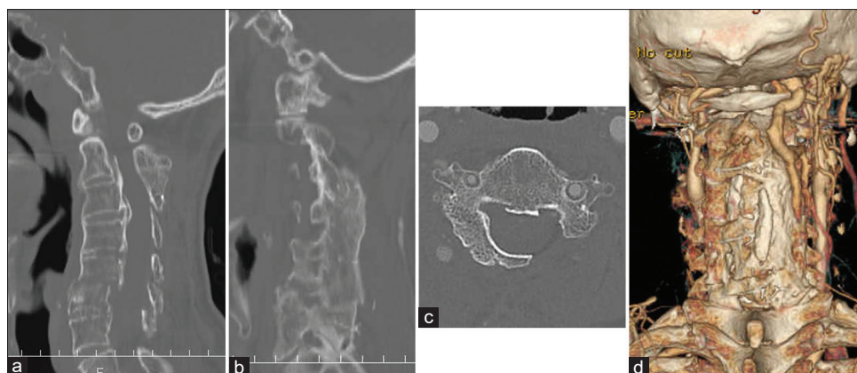
Figure 1: Initial computed tomography image. (a) Midline sagittal image. (b) Parasagittal image. (c) Axial view. (d) Three-dimensional computed tomography