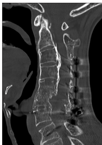
Figure 3: Computed tomography image 6 months postoperatively: Midline sagittal image

no neurological improvement was observed up to 3 years postoperatively.