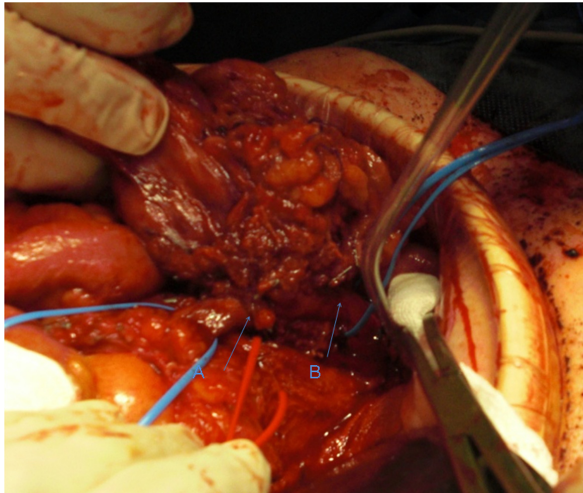
Figure 1 Resection and reconstruction of the superior mesenteric vein with superficial vein segment. (A) Distal anastomosis. (B) Proximal anastomosis. The red vessel loop encircles the superior mesenteric artery.

Accordingly, a right mid-thigh incision was performed, and an adequate SFV segment up to the junction with the profunda femoris vein was harvested. The duration from the vein preparation and harvest to skin closure was 15 to 20 minutes. During the venous reconstruction, a solution of 5000 U of heparin was delivered locally through the SMV. No valvulotomy was performed. The pancreatic head resection was immediately followed by the construction of a proximal anastomosis between a non-reversed SFV segment 3 cm to 4 cm in length and the central stump of the SMV in an end-to-end fashion (Figure 1). The peripheral anastomosis was created in a similar fashion. The duration of the creation of each anastomosis was 10 minutes. Intra-operatively, the patency of the reconstruction was confirmed by a continuous wave Doppler signal. The operation was completed with the creation of pancreatojejunostomy and a new ileotransversostomy.