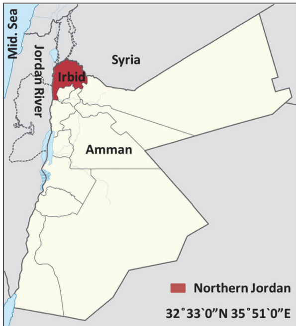
FIGURE 1: Map of Jordan showing the geography of the study area.

These include, among others, PTCH1 and SMO genes which are key components of the Hedgehog (Hh) pathway, TP53 gene, and other RAS protooncogene family members [9, 10].