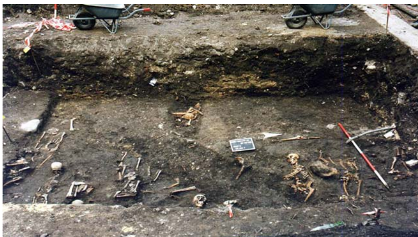
Fig. 1 Photograph of the excavation at the Onze Lieve Vrouwe Kerk in the city of Maastricht

An archaeological investigation of the Pandhof site was performed and the artifacts found were dated by stratigraphy (dating based on geological superposition of artifacts), and/or seriation (dating using the change of ‘fashion’ of artifacts over time to estimate the year of burial). After completion of the archaeological examination the excavated human remains were packed individually and sent to our department. After the bones of each individual were