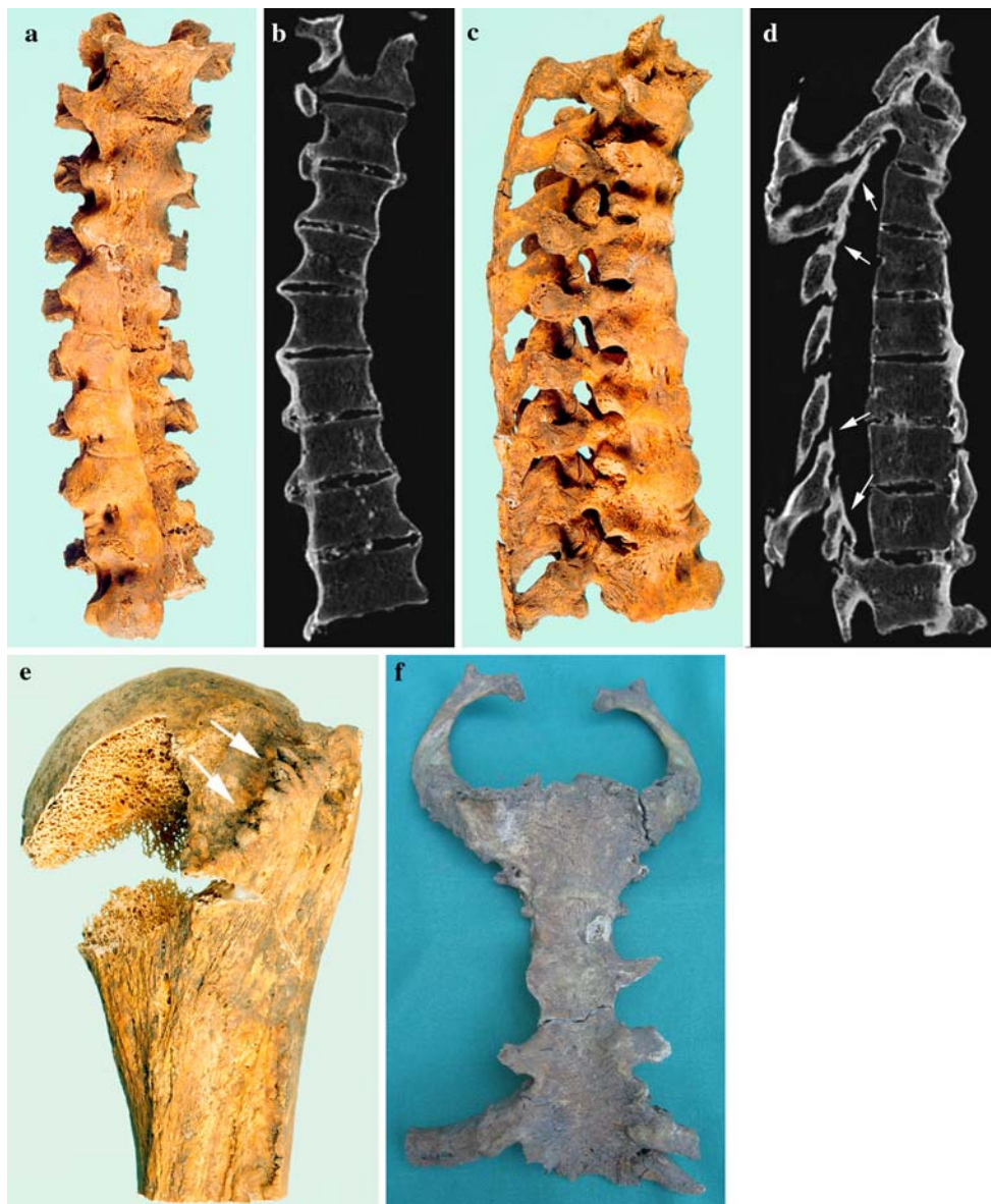
Fig. 2 Photographs of skeletal remains from a 47 to 63-year-old male (grave 25) showing: a a frontal view of the thoracic spine with obvious ossification of the anterior longitudinal ligament except at the trajectory of the aorta; b a coronal multiplanar reformatted view from a CT scan demonstrating the same anterior ligament ossification and preservation of most disk spaces; c the same archaeological specimen from a lateral viewpoint demonstrating the extensive ossification of all ligamentary structures; d the corresponding sagittal multiplanar reformatted view from a CT scan. Note also the flavum ligament ossification ( arrows ) and unaffected facet joints; e the left humeral head with ossified insertion of the subscapular muscle at the minor tubercle ( arrow ); f the sternum with signs of extensive ankylosis and both first ribs attached

In grave 43, a male 48 to 56 years-old had been buried. DISH was established by the ossification of the anterior longitudinal and supraspinal ligament (Fig. 3a), at multiple levels of the thoracic spine. This part of the spine had subsequently become ankylotic without involvement of the