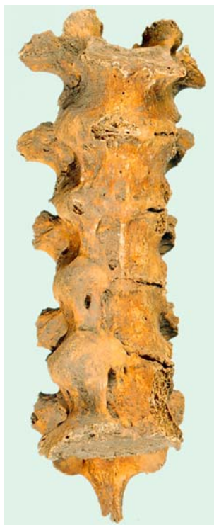
Fig. 4 Photograph of skeletal remains from a 57 year-old-female (grave 44) showing ossification of the anterior longitudinal ligament exhibiting the typical 'flowing wax' phenomenon

intervertebral and facet joints. Collapse of the tenth and eleventh thoracic vertebral bodies (probably from traumatic origin), had led to a considerable kyphotic deformity (Fig. 3b). This individual also had bilateral osteomyelitis of both tibia and fibula.