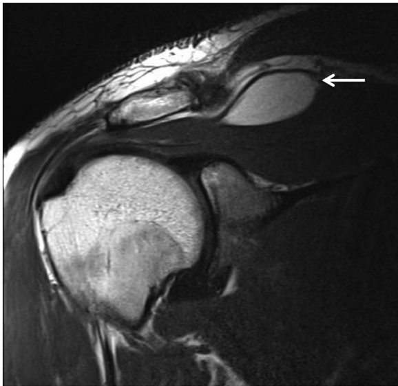
Fig. 1. Coronal Oblique Proton Density Image demonstrates an elliptical intramuscular mass (white arrow) in the superior aspect of the right supraspinatus muscle. The signal is homogeneous and identical to subcutaneous fat signal.