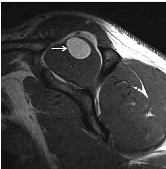
Fig. 2. Sagittal Oblique T1 weighted image demonstrates the fat signal mass within the supraspinatus muscle belly (arrow).

formed to further evaluate the patient's shoulder and assess for rotator cuff tears not evident on the ultrasound. The MRI identified a 35 \times 17 \times 18 mm ovoid intramuscular mass lesion within the superior aspect of the supraspinatus muscle (Fig. 1). The lesion followed fat signal on all sequences including fat saturated sequences and did not contain any thick septations or nodular components, consistent with a benign intramuscular lipoma (Fig. 2). Co-existing pathology demonstrated on the MRI included a small intrasubstance delamination tear of the infraspinatus tendon and moderate acromioclavicular joint degeneration with an inferior acromioclavicular joint osteophyte causing mild impingement on the supraspinatus.