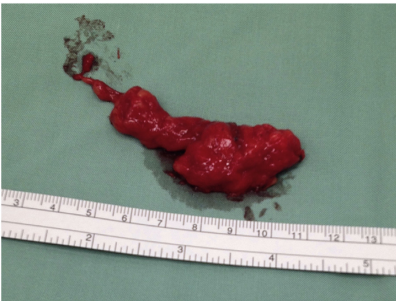
Fig. 4. Post-operative macroscopic image of excised intramuscular lipoma from the substance of the body of supraspinatus.

a failed period of conservative management and in the planning stages for operative management. This case is the first case reported that has utilised combined arthroscopic and open operative management, to address both the subacromial impingement as well as the excision of an intramuscular lipoma within the supraspinatus muscle, with normal function at 12-month review.