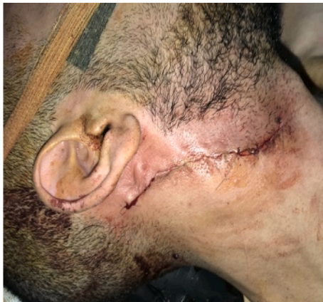
Fig. 3. Immediate post-operative appearance and at first week.

surgery and the anti-tetanus serum. A follow-up examination in Hospital via patient interview and physical examination at the first and the fourth months was without particularity.(Fig. 4).