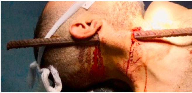
Fig. 1. Penetrating concrete bar on the right side.