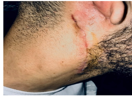
Fig. 4. The appearance of the wound 1 month post-operative.

Recently, the management of trauma to the penetrating neck has gone from compulsory exploration of the neck to selective management.