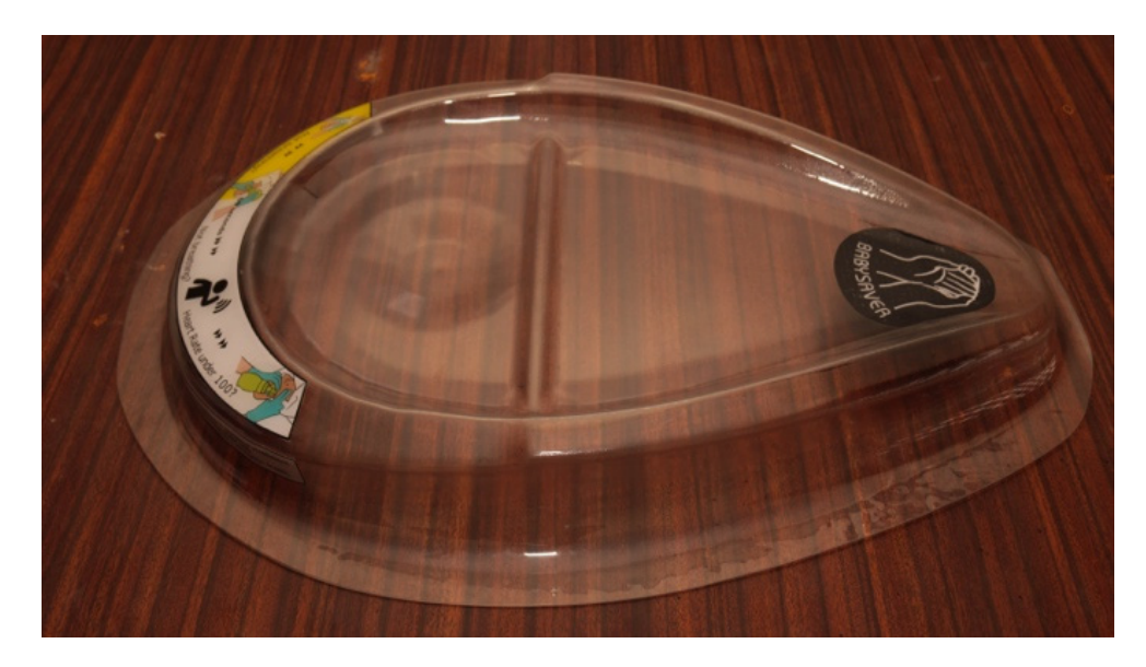
Figure 4. The tray.

The tray forms a clear plastic lid (Figure 4), that fits neatly into the base to form a toolbox. When the tray/lid is inverted, it forms a flat support platform. The platform provides a stable, clean, and smooth cradle to hold the neonate while the umbilical cord remains connected to the placenta at the time of birth. The weight of the tray is 950 g. The broad end is 455 mm wide, the longest length 685 mm and the depth 70 mm. It is 2 mm thick.