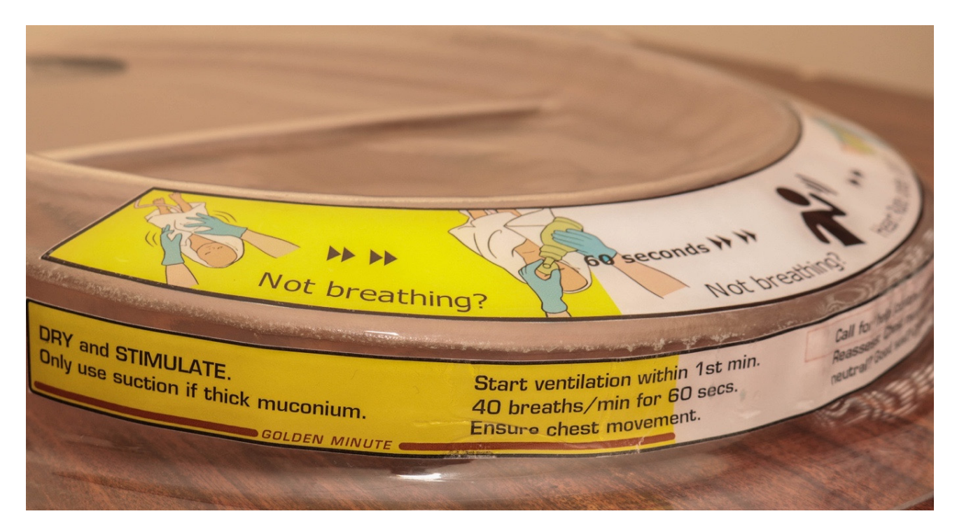
Figure 5. Pictorial instructions of helping babies breathe on the tray.