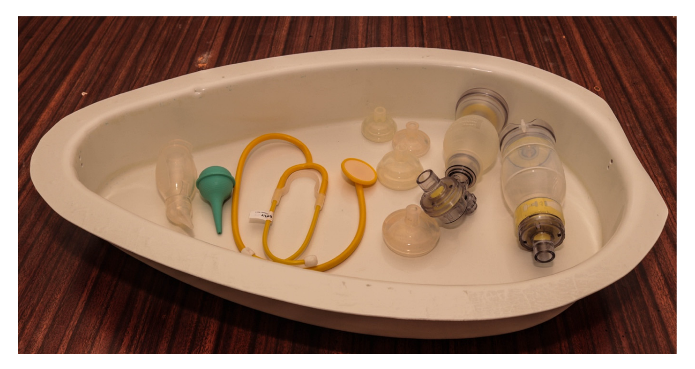
Figure 6. The base.