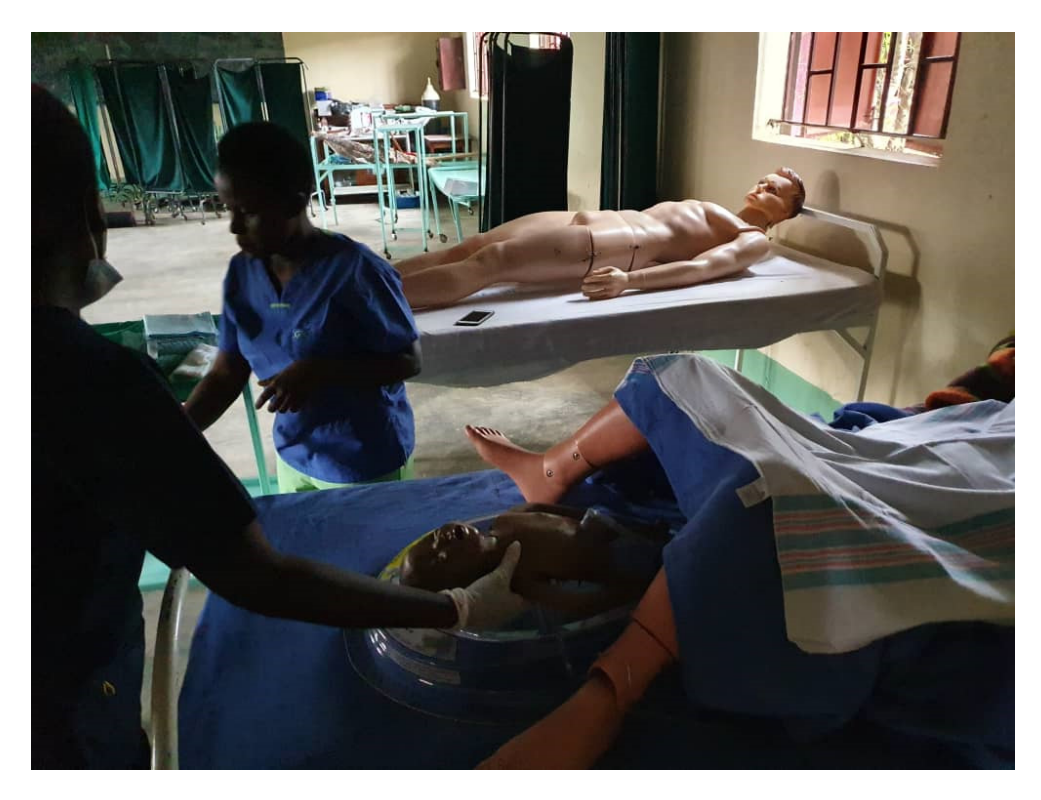
Figure 3. Demonstration of the BabySaver design at birth.