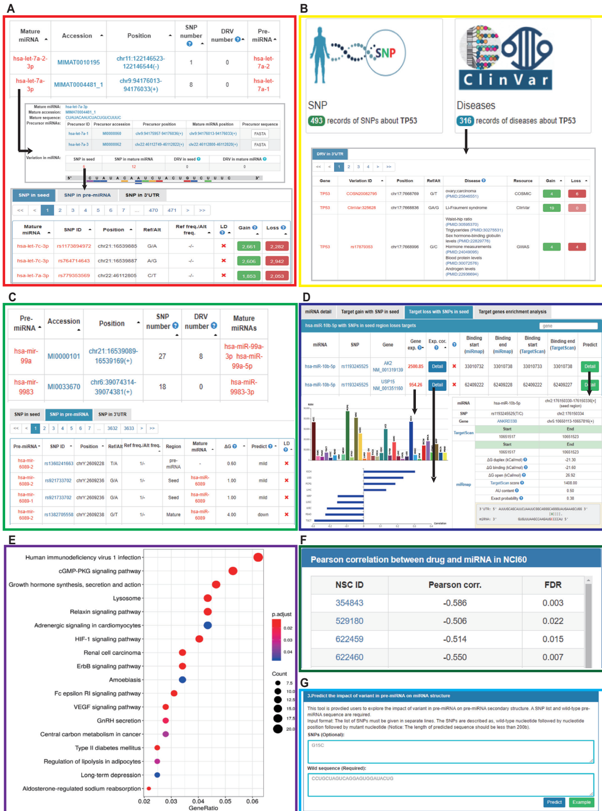
Figure 2. The utilities and new modules of miRNASNP-v3. (A) The SNVs in the seed regions and their effects on the target gains and losses. (B) The information of SNVs on gene 3'UTRs and their effects on the alteration of miRNA target binding. (C) The effects of SNVs on the changes of minimum free energy and secondary structure for pre-miRNAs. (D) The detail information of miRNA-target gain and loss, expression profiles, expression correlations and binding site details. (E) GO and KEGG pathway enrichment analysis for the gained or lost targets. (F) Correlations between drug sensitivity and the expression level of miRNAs. (G) Online prediction tools for potential alterations of miRNA target binding and secondary structure of a pre-miRNA for user customized sequences.