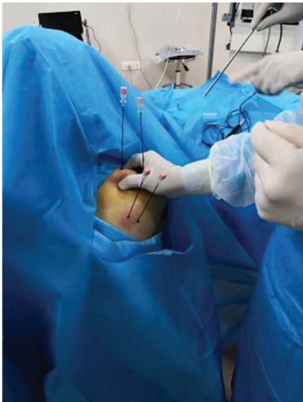
Figure 1. Shoulder joint radiofrequency treatment.