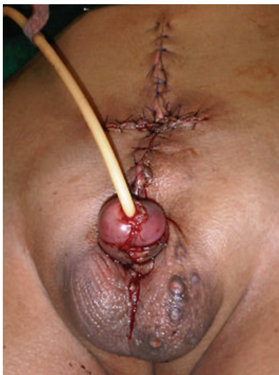
FIGURE 2: Final result after surgery.

may be orthotopic or ectopic. Division of the penis may be sagittal or frontal and symmetric or asymmetric, in shape and size [1, 3]. Schneider divided diphallia into three groups [2–4]: diphallia of the glans alone, bifid diphallia, and complete diphallia. Villanova and Raventos added a fourth category, pseudodiphallia. The urethra shows a range of variations, from functioning double urethras to complete absence of the urethra in each penis [2]. The majority have a single corpus cavernosum in each organ. The meatus may be normal, hypospadias, or epispadias, and the scrotum may be normal or bifid. The testes are normal, atrophic, or undescended [2, 4]. A later classification currently widely accepted includes two main groups: true diphallia and bifid phallus [3, 4]. These two groups are further divided into partial or complete duplication. True complete diphallia refers to complete penile