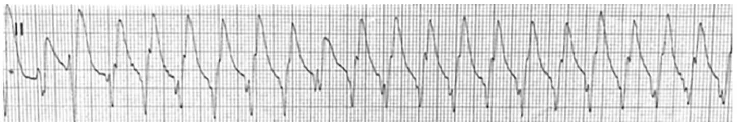
Image 1. Rhythm strip demonstrating ventricular tachycardia (monomorphic). Heart rate = 143 beats per minute.

blood gas values, pointing to respiratory dysfunction and subsequent metabolic and respiratory acidosis as an additional plausible etiology of SUDEP. However, cardiac arrhythmias sometimes coincide with epileptic seizures, and some individuals may have components of both cardiogenic syncope and epilepsy. In a recent case report of a patient presenting to an ED with a seizure, automatic implanted cardioverter defibrillator interrogation revealed ventricular