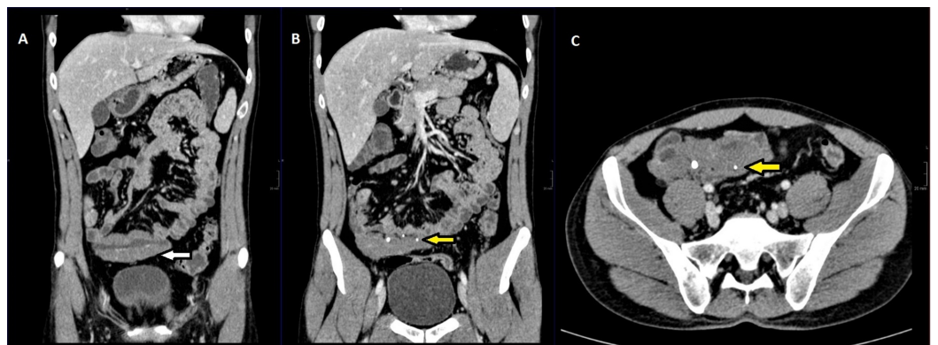
FIGURE 3: Two coronal and one axial reconstructions of

Because of these findings, computed tomography enterography (CTE) was performed, which showed phleboliths and transmural wall thickening in a 10-cm segment of the distal ileum with homogeneous contrast enhancement (Figure 3).