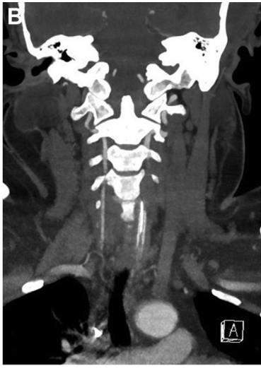
Figure 2. (A) Computed tomography venogram demonstrating the absence of contrast opacification in the left internal carotid artery and M1 and A1 segments consistent with occlusion. The major venous sinuses were patent. (B) Subsequent computed tomography angiogram showing complete occlusion of the left common carotid artery from the origin at the aortic arch.