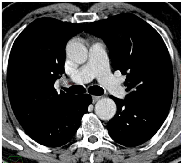
Fig. 2 – September 2019. Axial portal-phase CT scan, revealing the dimensional stability of the right hilar lymph node.

In all cases reported, in the clinical context of cancer history lymph node enlargement and metabolic uptake generate a diagnostic dilemma and might lead to further unnecessary examinations [2–5].