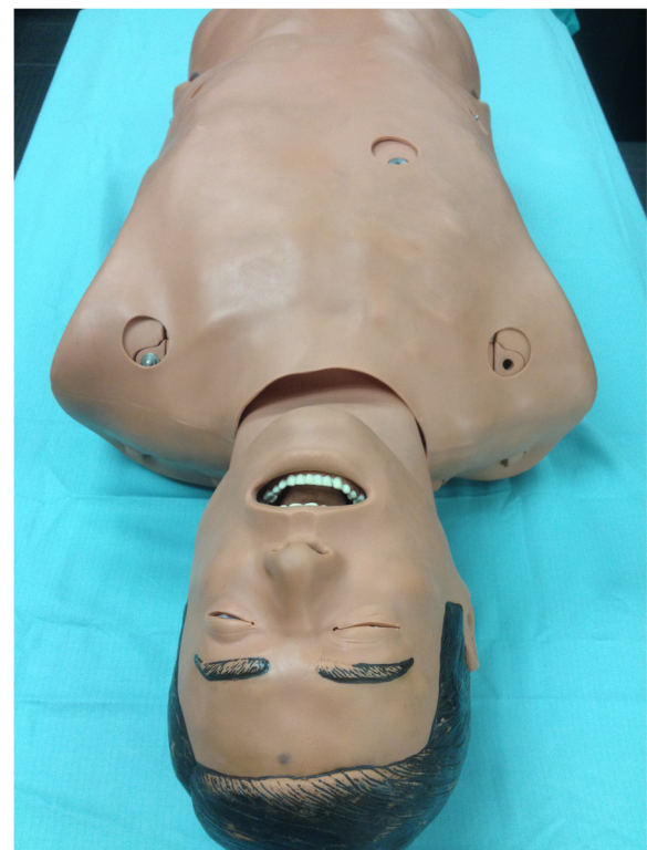
Fig. 1 The Human Airway Anatomy Simulator (HAAS)

On the HAAS, Expert subjects performed bronchial blocker (Arndt Blocker, Cook Medical, Bloomington, IN) and double lumen endobronchial tube (Mallinckrodt, 35Fr, Covidien, Ireland) insertion.