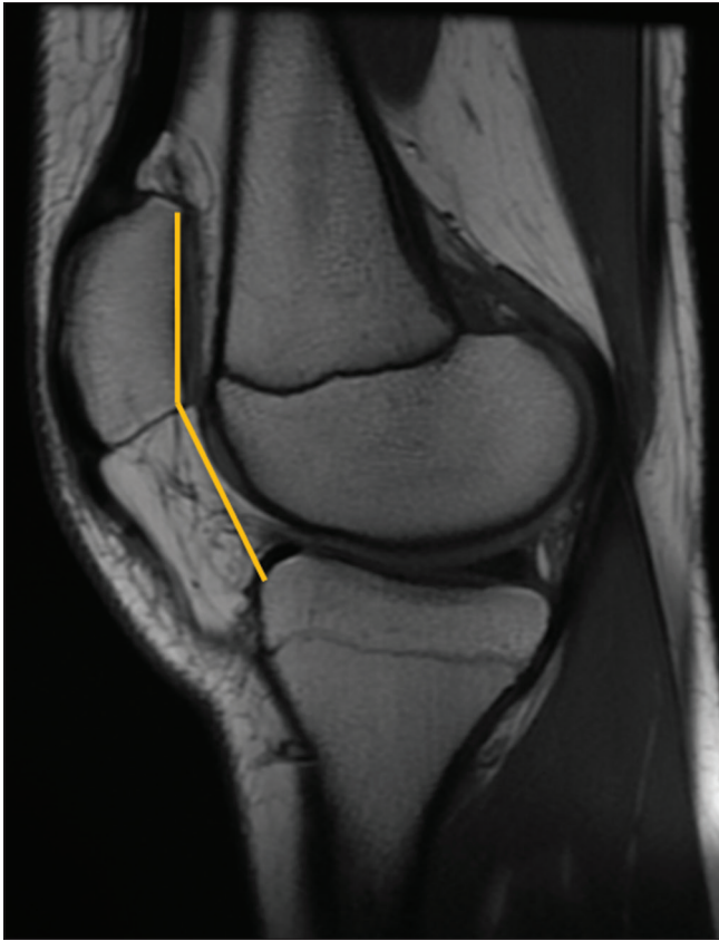
Figure 2: Caton–Deschamps indices: from patellar articular cartilage length and the distance between the lower point of the part of the patella that makes contact with the femur to the top of the tibial plateau