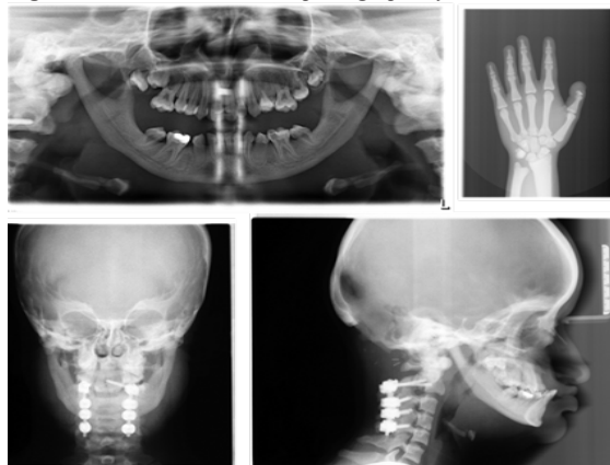
Figure 6. Radiographs of case 3.