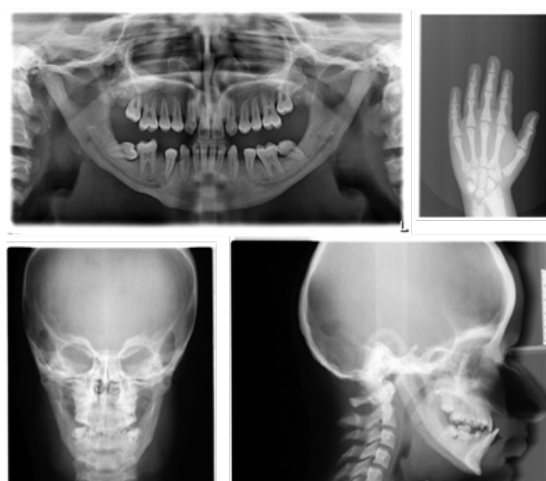
Figure 4. Radiographs of case 2.