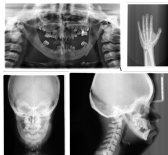
Figure 2. Radiographs of case 1.