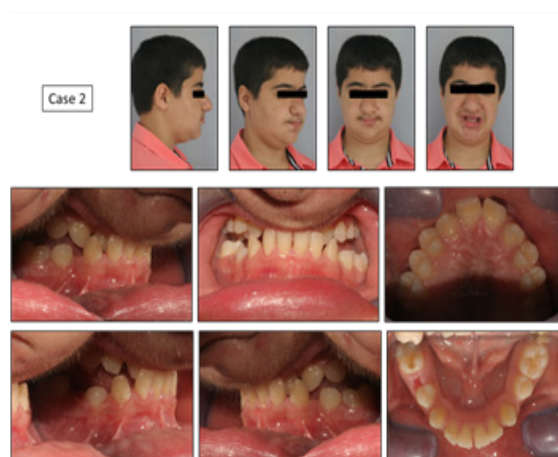
Figure 3. Intra- and extra-oral photographs of case 2