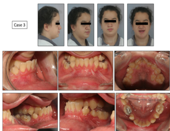
Figure 5. Intra- and extra-oral photographs of case 3.

According to McNamara analysis, the transpalatal width was 2,3 mm. The teeth numbered 17,18,27 and 28 have not yet erupted, whereas those numbered 35,43,45 have been lost. Patient had a skeletally concave profile but it was balanced by the soft tissue (Figure 5 and 6).