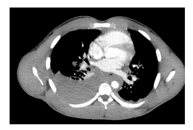
Fig 2. Computed tomography scan (transverse plane) shows right-sided hematothorax and hematomediastinum.

A magnetic resonance angiography after 6 months showed a patent interposition graft. An oscillographic examination revealed normal amplitudes on both upper extremities. The patient was