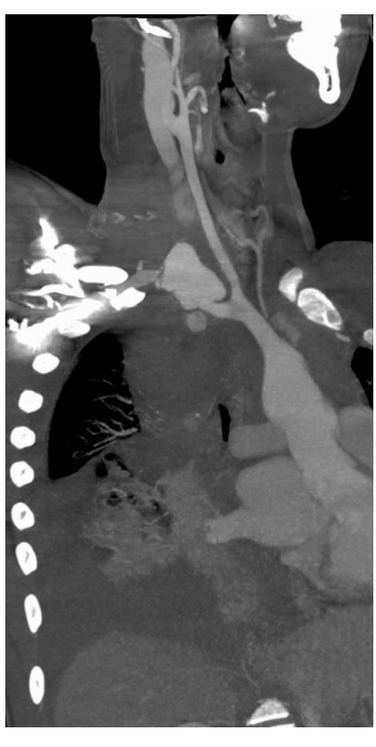
Fig 1. Reconstructed computed tomography image shows the ruptured right subclavian artery and the development of a pseudoaneurysm with a 4-cm diameter.

hematothorax (Fig 3). The patient complained about hoarseness, and an otolaryngologist's examination showed a paresis of the right recurrent laryngeal nerve. An intraoperative injury of the recurrent laryngeal nerve was supposed, and logopedic therapy was started. Platelet inhibition therapy with aspirin (100 mg/d) was started, and the patient was discharged 9 days after surgery.