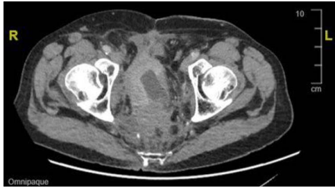
Figure 1: CT image showing an extensive mass in the presacral region with invasion to the urinary bladder and both ureters.