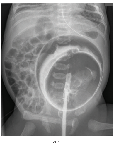
FIGURE 1: Upright anterior-posterior abdominal X-ray showing a big cystic lesion in the left hemiabdomen with complex contents (a); supine anterior-posterior abdominal X-ray after contrast enema (b).