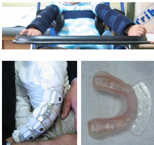
Figure 2 Management of self-injurious behaviour. The cornerstone of day-to-day management of Lesch-Nyhan syndrome is still adapted physical restraint to protect patients from themselves. For instance, elbow restraints allow hand use without the possibility of finger mutilation, and dental guards prevent cheek biting. Patients themselves request restrictions and became anxious if they are unrestrained.

Self-injurious behaviour must be managed with a combination of physical restraints, behavioural and pharmaceutical treatments [82]. Benzodiazepines and carbamazepine are sometimes useful for ameliorating behavioural manifestations and anxiety. Stress increases self-injurious behaviour. Thus, stressful situations should be avoided and aversive techniques should not be employed. Instead, behavioural extinction methods have proven to be partially efficacious in a controlled setting. However, the cornerstone of day-to-day management of Lesch-Nyhan syndrome is still adapted physical restraint to protect patients from themselves. For instance, elbow restraints allow hand use without the possibility of finger mutilation, and dental guards prevent cheek biting (Figure 2). Patients themselves request restrictions and became anxious if they are unrestrained, and sometimes