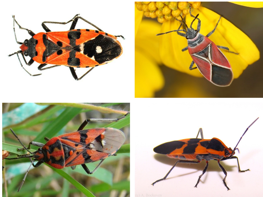
Figure 3. Four extensively studied species of Lygaeidae. Top right Neacoryphus bicrucis (photo courtesy of Jillian Cowles), bottom right Oncopeltus fasciatus (photo courtesy of Alison Bockoven), bottom left Spilostethus pandurus (David Shuker) and top left Lygaeus equestris (Liam Dougherty).