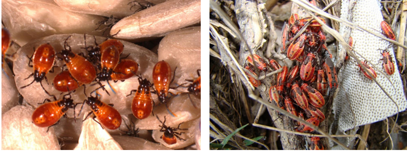
Figure 4. Right – Laboratory raised second instar nymphs of the species Spilostethus pandurus showing characteristic black and red coloration. Left – an aggregation of late-instar Lygaeus creticus nymphs and adults. Sicily.

Oncopeltus genus have been observed in aggregations containing both adults and nymphs (Root and Chaplin 1976). We will also discuss aggregation in the Lygaeidae further below when we consider the importance of pheromones. While groups are often considered to comprise kin, the extent of nonkin aggregations has yet to be investigated. As mentioned above, in some temperate species adults also aggregate for hibernation. This has been most extensively studied in the species Lygaeus equestris where hibernating adults typically enter reproductive diapause before aggregating at overwintering sites.