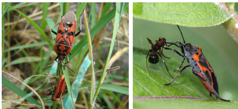
Figure 2. Left - An adult Spilostethus pandurus feeding on a Lygaeus creticus nymph. Sicily. Right - A Lygaeus kalmii feeding on an ant.

Third, four species of Nysius ( Nysius plebeius , N. expressus , and two species not identified to species level) have been found to harbor the primary gamma-protobacterial endosymbiont Schneideria nysicola in a pair of bacteriome structures (Matsuura et al. 2012). These authors also identified Wolbachia and a novel alpha-proteobacterium in these species, finding the latter in five other species