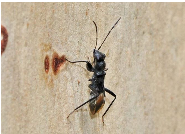
Figure 5. An ant-mimicking Seed Bug - Daerlac nigricans – from the Family Rhyparochromidae.

In terms of interspecific interactions, one particularly fascinating interaction concerns ant mimicry or “myrmecomorphy” (McIver and Stonedahl 1993), which is widespread in the Lygaeoidea and appears to have evolved multiple times (Schuh and Slater 1995). This mimicry is thought to act as an anti-predator defence as many predators avoid ants (Durkee et al. 2011) and may be morphological (Fig. 5) or behavioral in nature. For example, Neopamera bilobata , a Neotropical lygaeid, moves with jerky, ant-like movements when disturbed. This has been described as “action mimicry” and is thought to cause predators to hesitate in their attack, allowing the bugs