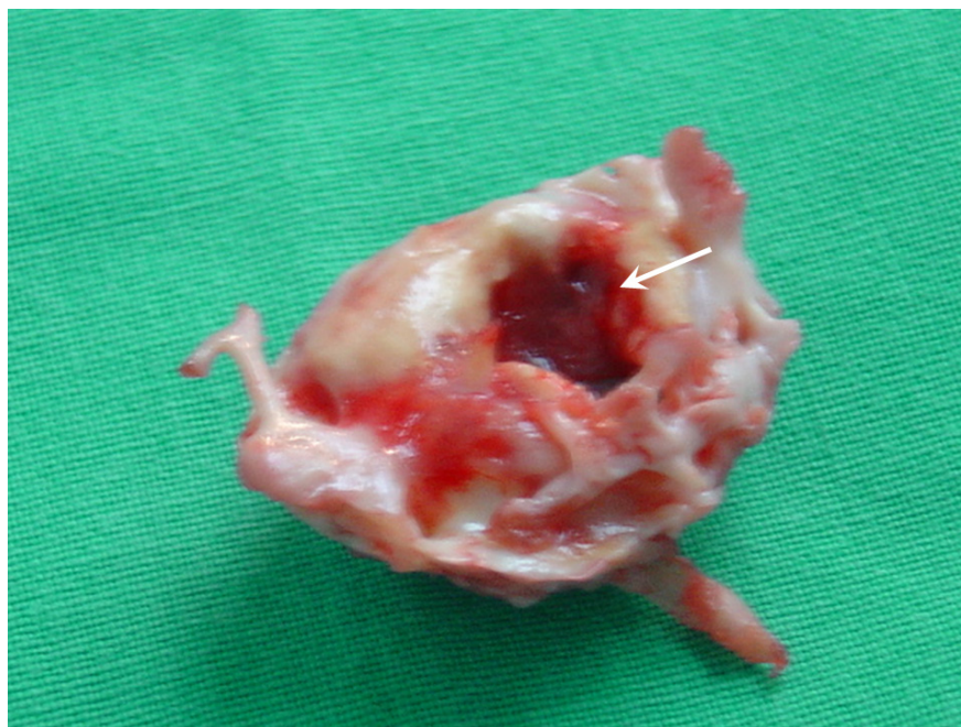
Figure 2 The round shaped calcification specimen with a central crater (white arrow) filled with clot.