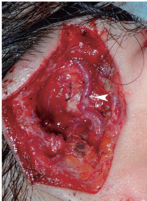
Fig. 4. Intraoperative findings after STA was anastomosed. After the aneurysm was resected, STA was anastomosed by the end-to-end anastomosing technique with a 9-0 nylon, using a microscope. Favorable reperfusion was found after anastomosis (white arrowhead).

To prevent STA injury, this study made the following recommendations for physicians who attempt to perform thread-lifting. Physicians should always (1) search for STAs by palpation before inserting the threads; (2) prevent the thread from piercing the STAs; and (3) attend a