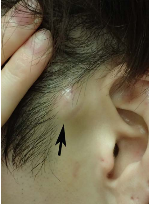
Fig. 1. Appearance of a soft mass on the left pre-auricular region of a 27-year-old man. A pulsatile soft cutaneous mass measuring 20 × 20 mm was found on the left pre-auricular region (black arrow).

STA was microsurgically performed with 9-0 nylon but no vein grafting (Fig. 4). No recurrence was observed for 3 months after surgery, and reperfusion was confirmed by enhanced computed tomography (CT) 2 weeks after surgery. (See figure, Supplemental Digital Content 1, which displays postoperative findings and enhanced CT. CT shows the reperfusion of superficial temporal artery (yellow arrow). http://links.lww.com/PRSGO/B622 .)