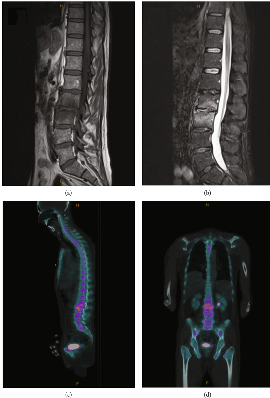
FIGURE 2: Magnetic resonance imaging (MRI) and single-photon emission computed tomography-computed tomography (SPECT-CT) images of the spine suggestive of L3/L4 discitis. Sagittal-view MRI whole spine demonstrates hypointense T1-weighted signal (a) and hyperintense short tau inversion recovery- (STIR-) weighted signal (b) surrounding the L3/L4 vertebral disc consistent with edema, with no evidence of collection. SPECT-CT whole spine shows increased uptake surrounding the L3/L4 vertebral disc in both sagittal view and coronal view consistent with L3/L4 discitis.

abdominal masses, or organomegaly or palpable purpura. Twelve lead electrocardiogram (ECG) demonstrated sinus tachycardia.