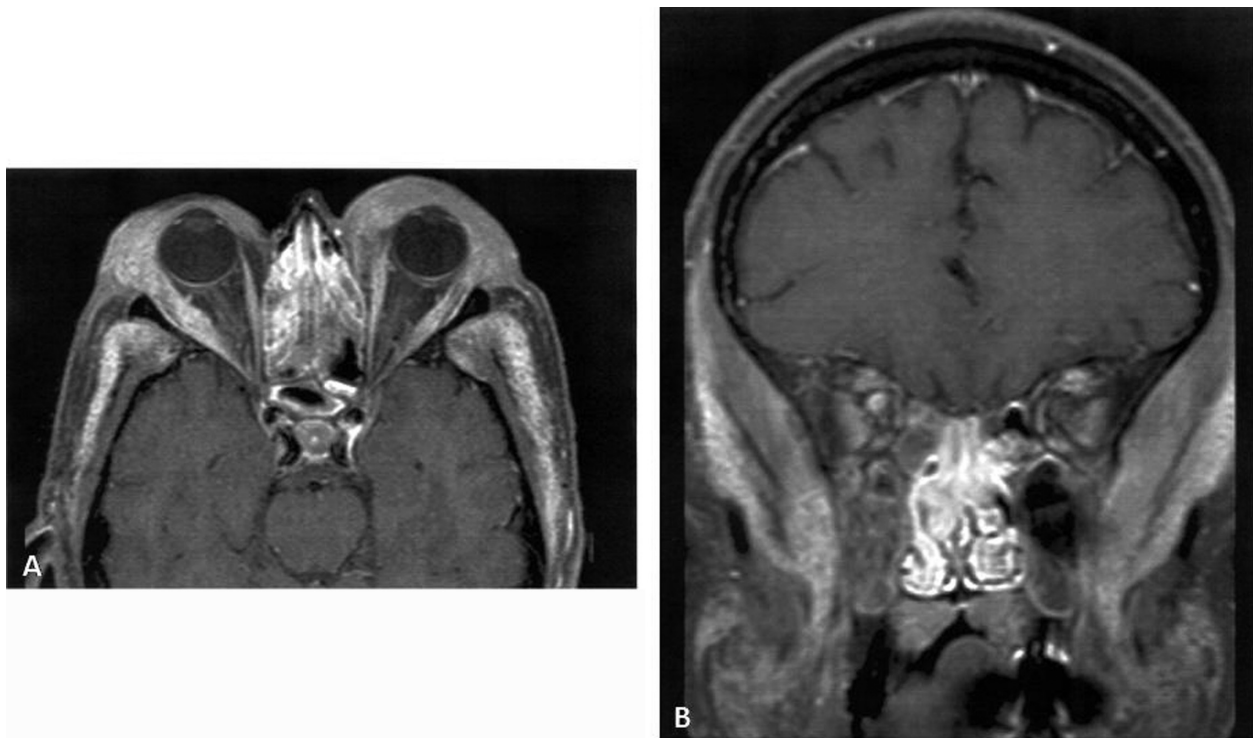
Figure 2 Axial A ) and coronal B ) contrast-enhanced fat-suppressed T_1 -weighted MR images showing bilateral eyelid, lateral rectus oculomotor, masticatory and temporal muscle enlargement and enhancement.