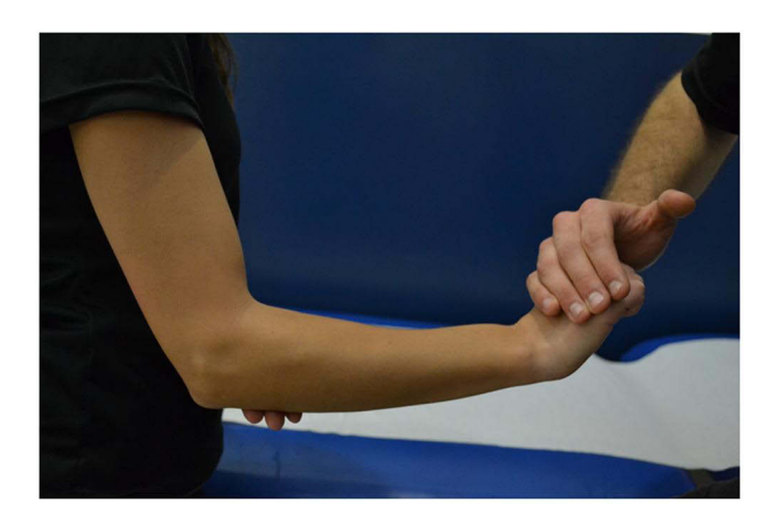
Figure 2 Index test initial position. Maximum wrist extension effort against resistance.

The patients were positioned in a sitting position with the shoulder slightly abducted, elbow flexed to 90°, forearm pronated, and wrist flexed so that the palm would face downwards. Then, the orthopedic surgeon stood beside the patient's affected side and resisted the maximum wrist extension effort (Figure 2). While maintaining this position, failure to resist the maximum wrist extension effort indicated a positive sign of this new physical maneuver (Figure 3).