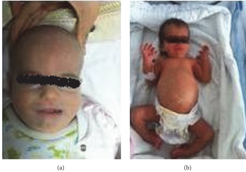
FIGURE 1: Coarse facial features with midface retraction, frontal bossing, bitemporal narrowing, wide anterior fontanel, low nasal bridge, abdominal distention, and bilateral talipes equinovarus are shown in physical characteristics of the baby.