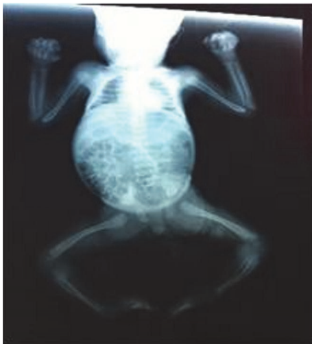
FIGURE 2: Babygram showing bowed long bones and broad ribs.