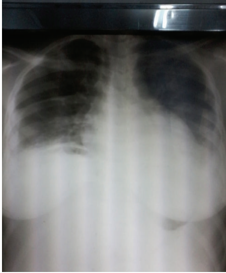
FIGURE 1: Chest radiograph showing a bilateral hydrothorax.

the occurrence of progressive abdominal distension in a context of amenorrhea and asthenia. Abdominopelvic pain is of recent onset (approximately 10 days prior to the patient admission) associated with a dry cough and difficulty breathing.