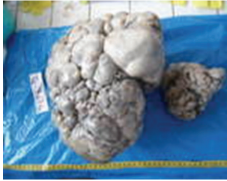
(a) View after formalin fixation: high tumors multi-lobulated. The smallest depended on the left ovary