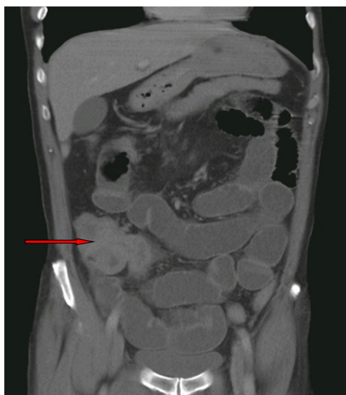
Fig. 1. CT image at presentation demonstrating a large caecal neoplasm with concurrent small bowel obstruction.