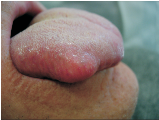
Fig. 1. Nodular lesion on the right ventral surface of the tongue. The lesion was asymptomatic, well defined, smooth with soft consistency and with normal lingual mucosal surface. Serena Cocca et al: Unusual complications caused by lipoma of the tongue. J Korean Assoc Oral Maxillofac Surg 2017