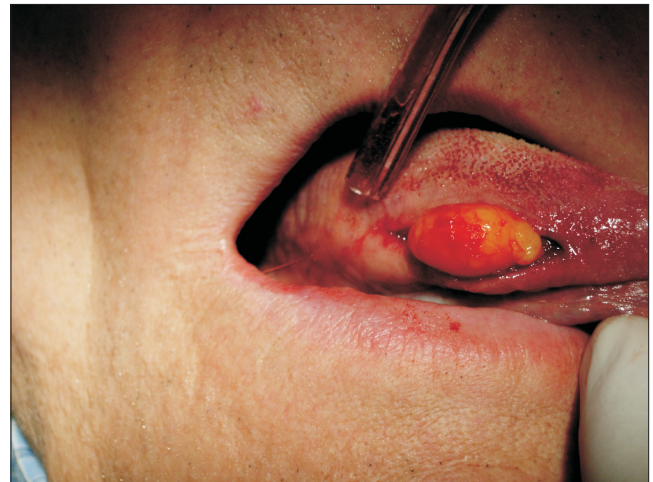
Fig. 2. Exposing the mass. An excisional biopsy and enucleation of the lesion was performed. Serena Cocca et al: Unusual complications caused by lipoma of the tongue. J Korean Assoc Oral Maxillofac Surg 2017