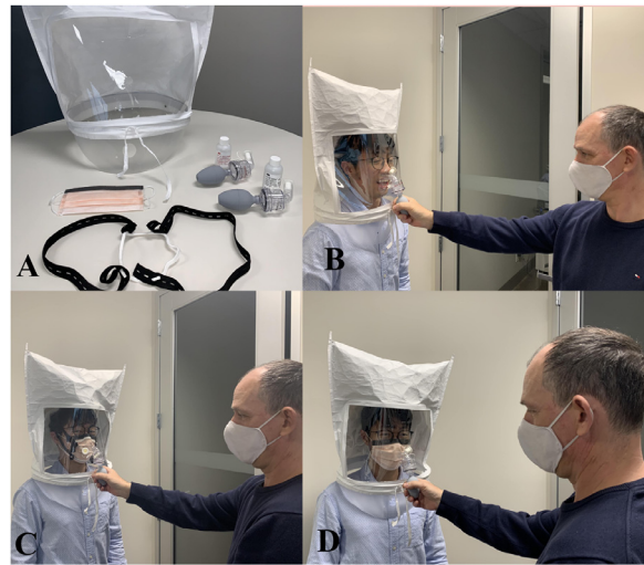
Fig. 2— Fit Test materials (A) and Fit Test steps, showing initial sensitivity test (B), Fit Test with custom mask fitter (C), and Fit Test with ASTM Level 3 regular facemask and no mask fitter (D).

secure the mask fitter over the regular face mask. To simulate the N95 respirator, the custom mask fitter was placed on top of an American Society for Testing and Materials (ASTM) Level 3 fluid-resistant face mask with ear loops (Halyard, Alpharetta, GA; Fig. 1). Each participant had only one mask fitter created, which was printed from the first successful 3D image capture.