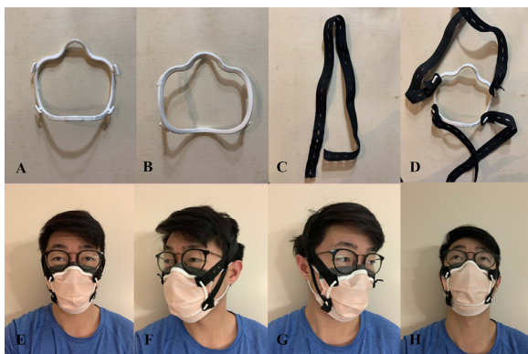
Fig. 1— Mask fitter frame shown with anterior (A) and posterior (B) view along with elastic sewing band (C) fastened to the mask fitter as a strap (D). Mask fitter worn showing frontal (E), left (F), right (G), and inferior (H) view.

Participants were recruited from Prism Eye Institute, a tertiary ophthalmology centre in Oakville, Ontario. Participants included technicians, front-facing administrative staff (such as front desk staff and surgical booking assistants), optometrists, ophthalmologists, and medical students. The Bellus3D (Campbell, CA) smartphone application was used on an iPhone XS (Apple, Cupertino, CA) smartphone to capture a 3D image of each person's face. 6 The standard size mask fitter frame was selected, and custom designed to the 3D shape of each participant's face. Each mask fitter design was exported as an STL file and printed by a Prusa i3 MK3S 3D Printer (Prusa Research, Prague, Czech Republic) using polyactic acid filament, a plant-based biodegradable plastic. Perforated 2-cm elastic sewing bands were used as straps to