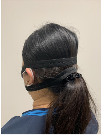
Fig. 6—Mask fitter elastic straps looped on top of a woman's hair ponytail to ensure a tighter seal.

of customization as there are only a few different models, which come in a single size and have nonadjustable elastic bands. However, participants in this study did comment on the difficulty of “fiddling around” with the straps and described them as “cumbersome.” Although this was not a factor directly measured in our study, spectacle-wearing participants mentioned how wearing the mask fitter prevented fogging of their glasses. Furthermore, ophthalmologists noted that the mask reduced fogging while using the slit lamp and microscope oculars.