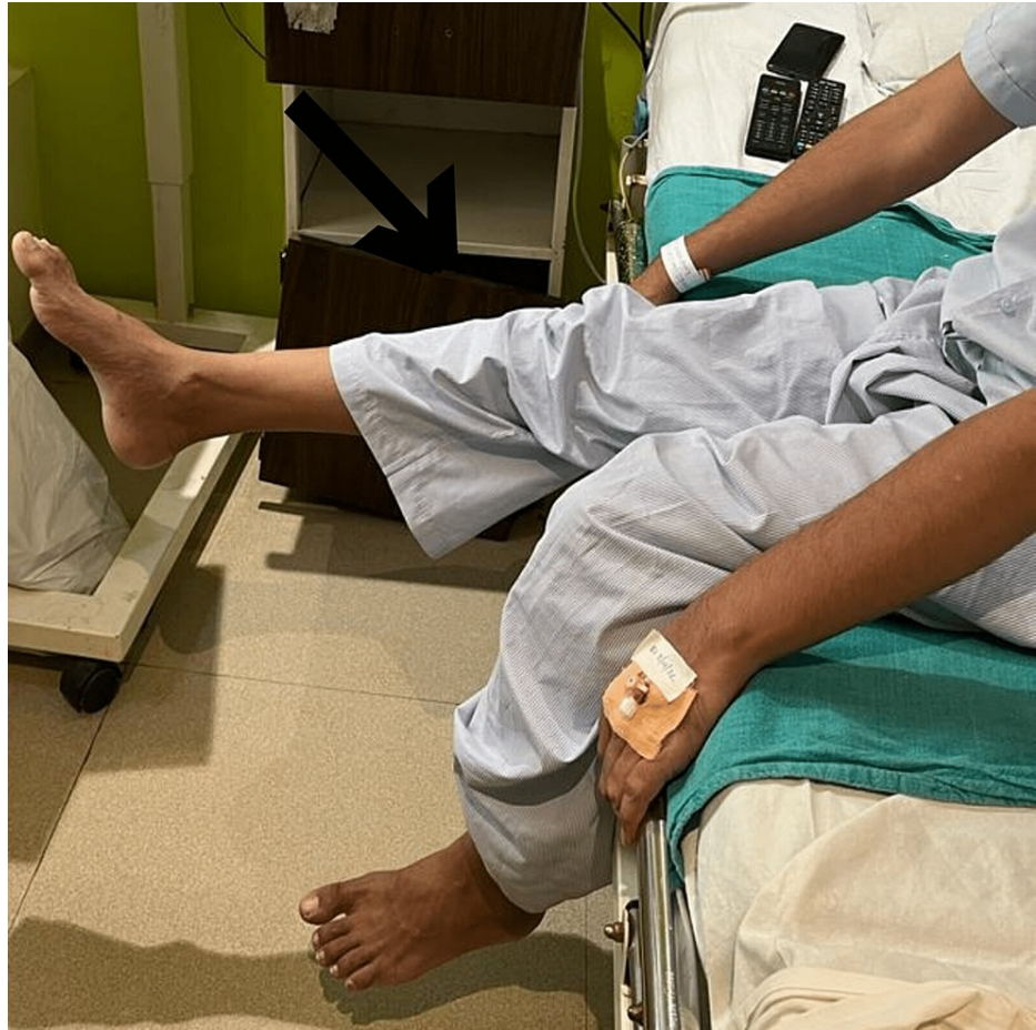
FIGURE 4: The figure demonstrates the patient performing dynamic quadriceps exercise post-operatively