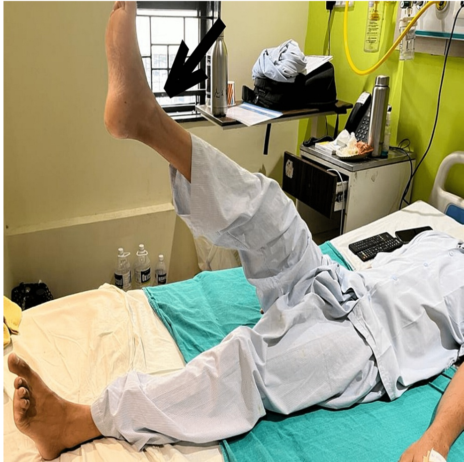
FIGURE 3: The figure shows the patient performing post-operative straight leg raise (SLR) (110°)