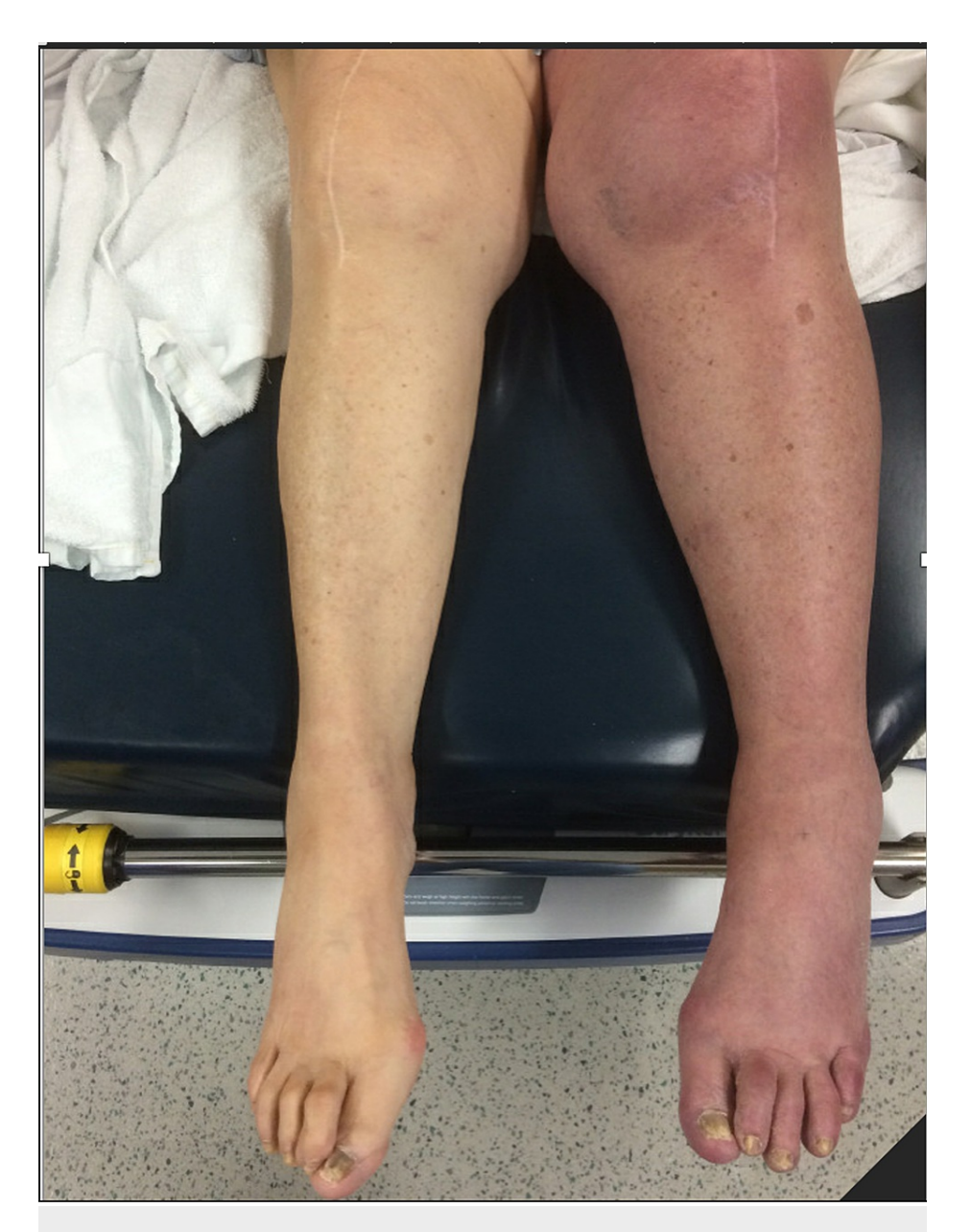
FIGURE 1: Discoloration of the left leg in the setting of PCD