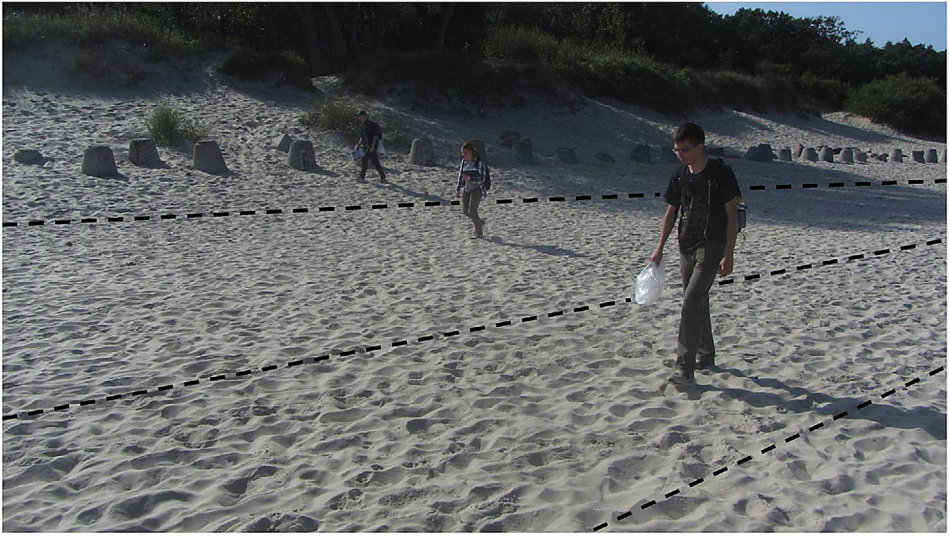
Fig. 2. The group of observers on the beach.

The proposed monitoring design helps to assess the beach contamination by geosynthetic debris only superficially. It is impossible to notice all the geosynthetic fragments during a visual inspection of the beach because the fragments: