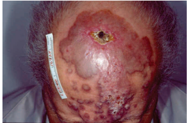
Figure 2. Progression of cutaneous angiosarcoma following two cycles of Caelyx ® .

As early as the first week following the completion of the radiation therapy there was evidence of tumour flattening and formation of eschars. At one month follow-up it was noted that there was significant fading of the tumour area and that the lesion had flattened. Continued improvement with further fading of the pigmented areas has occurred over the ensuing months. The patient has now been followed