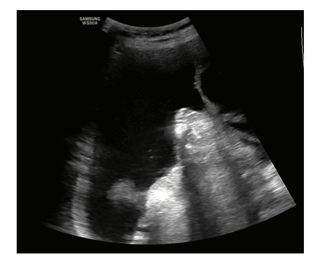
Fig. 3. Ultrasound evaluation of a free fluid pocket in the peritoneal cavity in the region of the left diaphragmatic dome (spleen)

The methods of ascites monitoring used to date include: serial measurements of body mass, abdominal circumference or protrusion index (an index of ascites intensity), which is a subjective scoring system assessing compression-induced deflection of the abdominal integuments measured in a line between the xiphoid process and pubic symphysis. Weight changes can indirectly indicate decreasing or increasing ascites. Of note is also the fact that changes in body weight and structure can be affected by the course of the underlying disease and the way of its treatment. Moreover, abdominal circumference measurements and the protrusion index assume that both the amount of fatty tis-