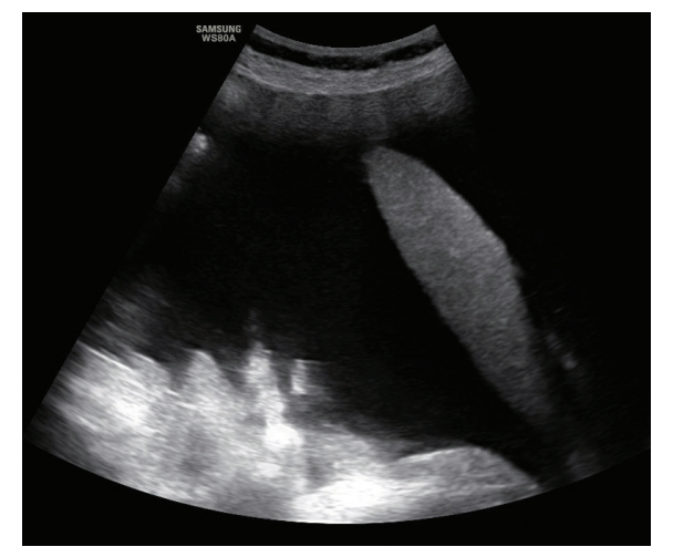
Fig. 4. Ultrasound evaluation of a free fluid pocket in the peritoneal cavity in the region of the right diaphragmatic dome (liver)