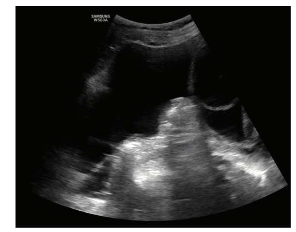
Fig. 2. Ultrasound evaluation of a free fluid pocket in the peritoneal cavity in the left inguinal region

Physical examination is often inaccurate. Noninvasive diagnostic procedures, such as computed tomography