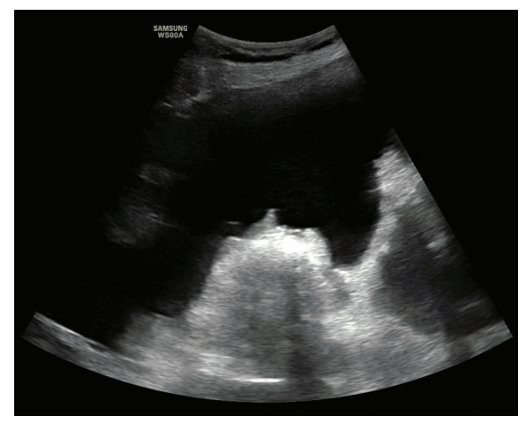
Fig. 1. Ultrasound evaluation of a free fluid pocket in the peritoneal cavity in the right inguinal region

monitoring. There were no statistically significant correlations between the AsI and the compared anthropometric methods for ascites monitoring before and after paracentesis.