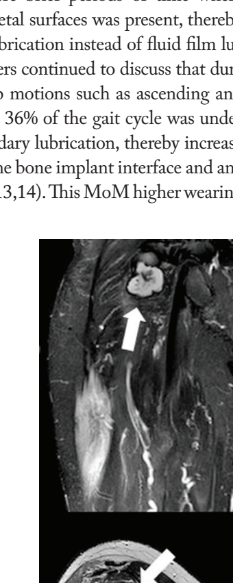
Figure 1. Pseudotumor of the right hip after Mom THA. MARS-MRI with pseudotumor (arrows) (A). Intraoperative views with metallosis (B).

For these reasons, the use of MoM sharply declined (15-17). Increased metal ion concentrations have shown to have local and systemic consequences including direct cytotoxic effects, thereby causing abductor deficiency, capsular attenuation, and bony reabsorption (1). Approximately 10 years after the peak of its use, numerous revisions became apparent because of these adverse reactions to metal debris (ARMD) (18,19). This debris can result in destruction of the local bone and soft tissues, as well as large invasive pseudotumors, which often bring to revision surgery for implant loosening (Figure 1) (18,20).