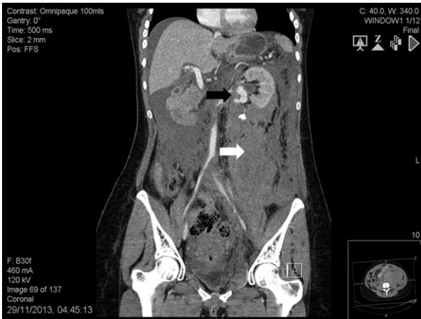
Figure 1: Abdomen contrast-enhanced computed tomography scan: massive retroperitoneal haematoma (white arrow) with active bleeding from a ruptured 2-cm left renal artery aneurysm (black arrow).