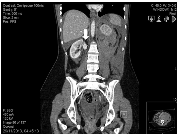
Figure 2: Abdomen contrast-enhanced computed tomography scan showing an intact 2.2-cm right renal artery aneurysm (white arrow).

ruptured left RAA and a contralateral RAA. At this point, it was felt a percutaneous approach would have been more appropriate. Contrast-enhanced computed tomography showed a massive retroperitoneal haematoma, a ruptured left RAA (Fig 1), and an intact right-sided RAA measuring 2.2 cm (Fig 2). Under selective angiography, the aneurysm was embolized and the bleeding controlled [3]. Recovery was rapid but a DMSA scan performed 2 weeks later, demonstrated reduced function in the treated kidney (37%). The risk of rupture of the right RAA was deemed significant and a plan for repair was made. The lesion was saccular, wide-necked and located at the artery bifurcation thus preventing endovascular treatment. We opted for hand-assisted retroperitoneoscopic nephrectomy, ex-vivo repair and autotransplant.