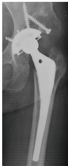
FIGURE 3: The AP radiograph of the left hip at 15 years after THA. The biological fixation of the stem was bone ingrown fixation.

Two hips showed subsidence. One hip was in the patient described above. The other hip had had femoral neck fracture during surgery. The stem had subsided 30 mm at six months after surgery, but showed no additional subsidence. At 7.5 years after surgery, the radiographs showed bone ingrown fixation. Ten-year survival rate was 94 (86–97)% when any surgery or revision for any reason was defined as end-point and was 99 (95–99.9)% when loosening or revision of the stem was defined as end-point.