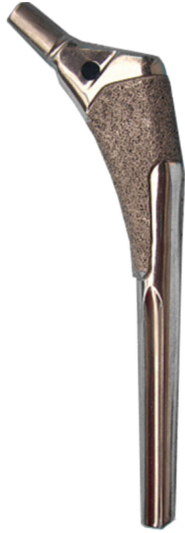
FIGURE 1: The Anatomic Fiber Metal plus stem.

osteonecrosis of the femoral head for 18 hips, and rapidly destructive coxarthrosis for two hips.