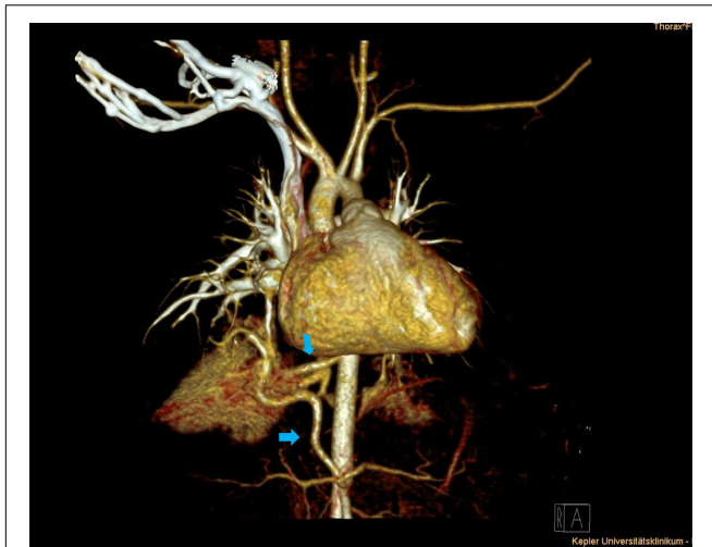
FIGURE 1 | Thoracic contrast-enhanced computed tomography scan (CECT) depicting right lower lobe hybrid lesion. Supra- and infra-diaphragmatic arteries originate from the descending aorta and the celiac trunk (blue arrows).