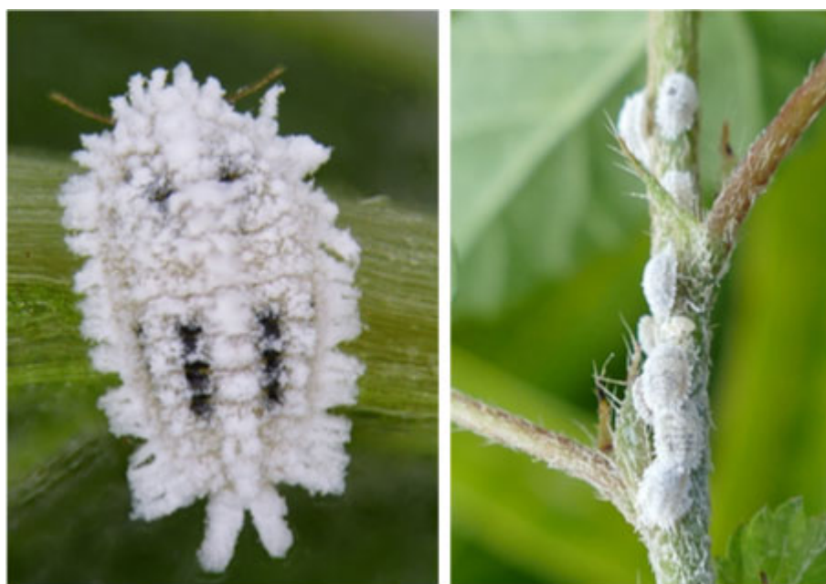
Figure 1: Phenacoccus solenopsis : teneral adult female (left), showing characteristic dark patches on the dorsum; colony of mature females (right), the dorsal markings are obscured by waxy secretions

The EPPO code 1 for this species is: PHENSO (EPPO, online).