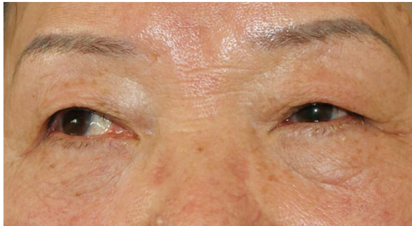
FIGURE 2. At 5 months later after surgery, the patient shows a partial ptosis and mydriasis in the left eye, associated with restricted adduction in the right gaze.

temporary occlusion is a prerequisite for patients of PcoA aneurysms because these lead to profuse hemorrhage due to high-pressured flow in the ICA. 17) When intracranial control of nutrient artery for the sac seems difficult, the ICA is explored in the neck before starting the craniotomy. 15) In this case, because the aneurysm had thick walls, clip application perpendicular to the long axis of ICA resulted in incomplete closure of blades and hemodynamic turbulence within the sac. 5) Therefore, the operator must employ the proximal and distal ICA traps to facilitate dissection of the aneurysm with arteriosclerotic plaque at the neck portion. 9) Nevertheless, if the bleeding persists, the temporary clip should be placed simultaneously on the PCoA itself when it large than normal. Lastly, no retracting the temporal lobe is also the principle to prevent premature rupture of PcoA aneurysm if the fundus is pointed laterally.