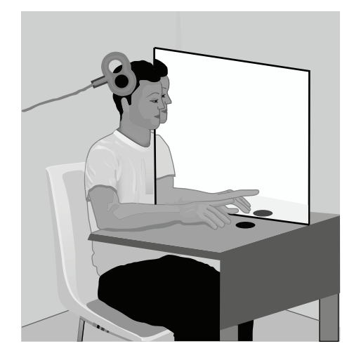
FIGURE 1: Schematic representation of the mirror visual feedback condition during motor task.

All subjects performed the experiments in the same order as they are listed above: DFV, MVF, and BVF.