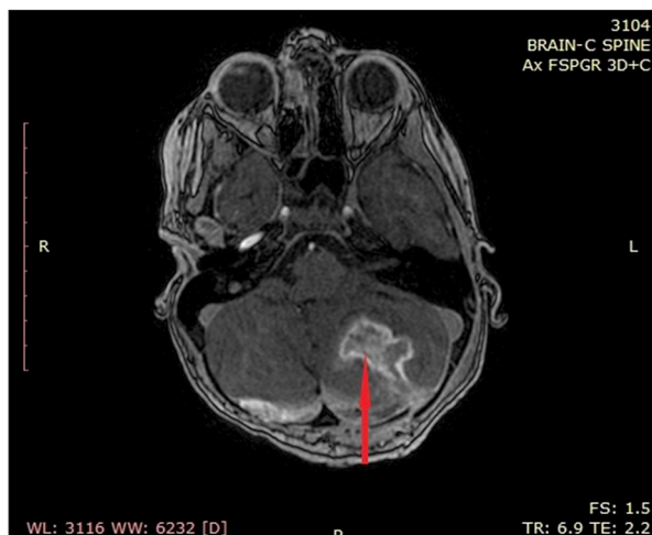
Figure 6. Post-operative magnetic resonance imaging (MRI), axial fast spoiled gradient echo-dual echo (FSPGR) 3D sequence after contrast administration, depicting the resection site of the tumor cavity without any residual remnants (red arrow).

Her clinical status was complicated from postoperative day 6 with transient diabetes insipidus and hyperpyrexia lasting a week. Infection loci were excluded with thorax plain radiographs, urine cultures, and blood cultures. C-reactive protein was unremarkable (0.3 mg/dL). Water deprivation investigation regarding diabetes insipidus was not available. Decreased