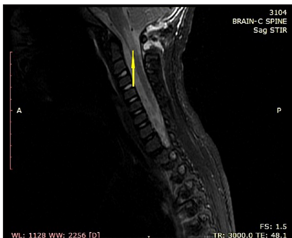
Figure 5. Post-operative magnetic resonance imaging (MRI), sagittal Short tau inversion recovery (STIR) sequence, depicting the infarction in the region of the cervico-medullary junction (yellow arrow).

After the operation, the patient was transferred to our intensive care unit. On awakening, the patient had impaired movement of the upper and lower extremities, which was observed from C5 dermatome and downwards. All muscle groups of arms had grade zero power; she was able to withdraw faintly from painful stimuli. Deep tendon reflexes were absent.