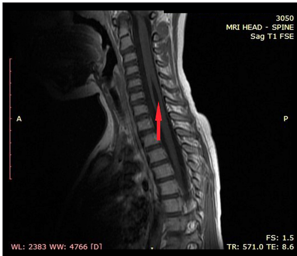
Figure 2. Preoperative sagittal magnetic resonance imaging (MRI), T1 weighted, fast spin echo (FSE) sequence, depicting the upper 1 of the 2 syringomyelic cysts located in the cervicothoracic region (arrow).