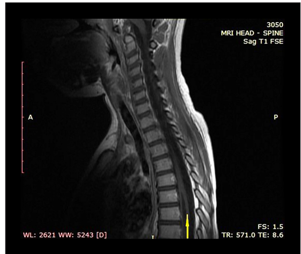
Figure 3. Preoperative sagittal magnetic resonance imaging (MRI), T1 weighted, fast spin echo (FSE) sequence, depicting the lower 1 of 2 syringomyelic cysts located in the cervicothoracic region (arrow).