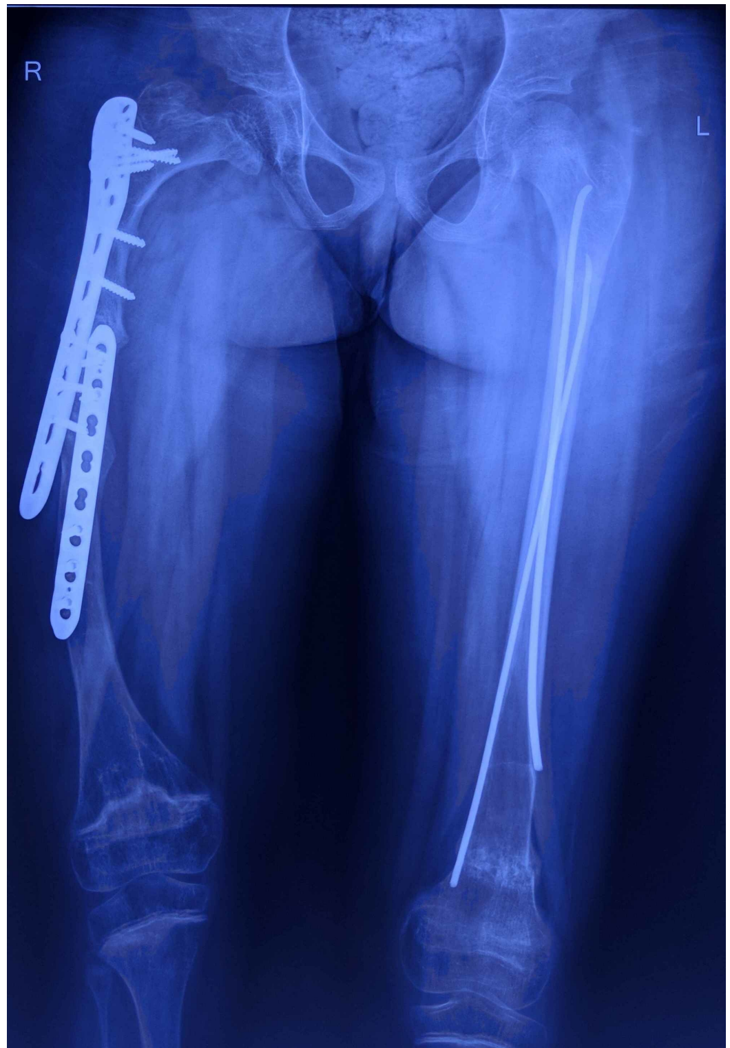
FIGURE 1: Anteroposterior radiograph of the patient at presentation showing LCP in situ on the right side and TENS on the left side

LCP: locking compression plates; TENS: Titanium Elastic Nail System