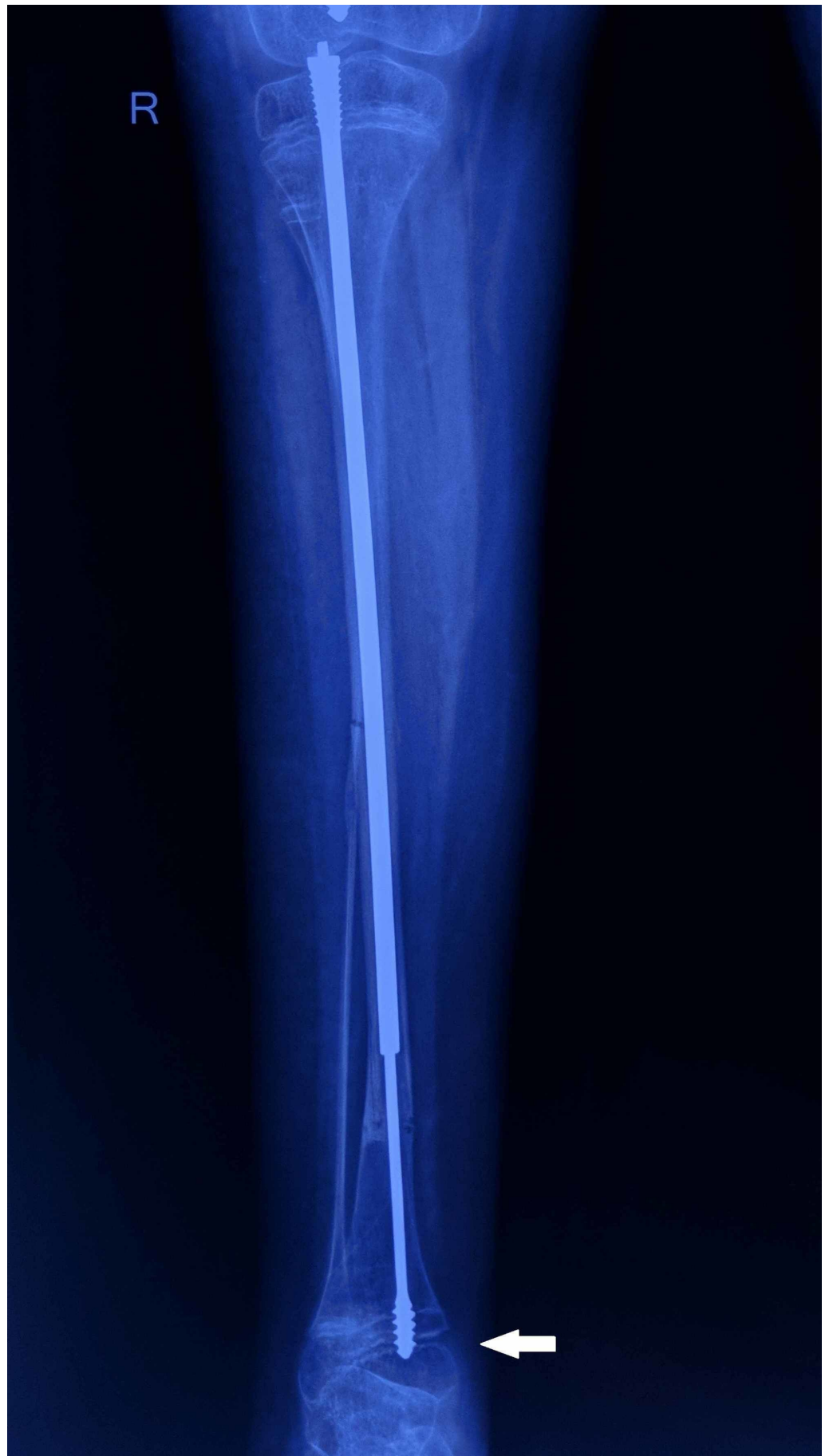
FIGURE 3: Follow-up radiograph of the right tibia