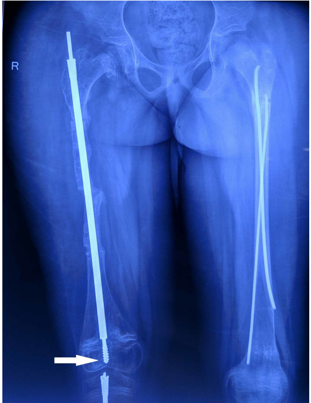
FIGURE 4: Follow-up radiograph of the right femur

The threads of the tibial female component and those of the male and female components of the femur were in appropriate location (Figure 4).