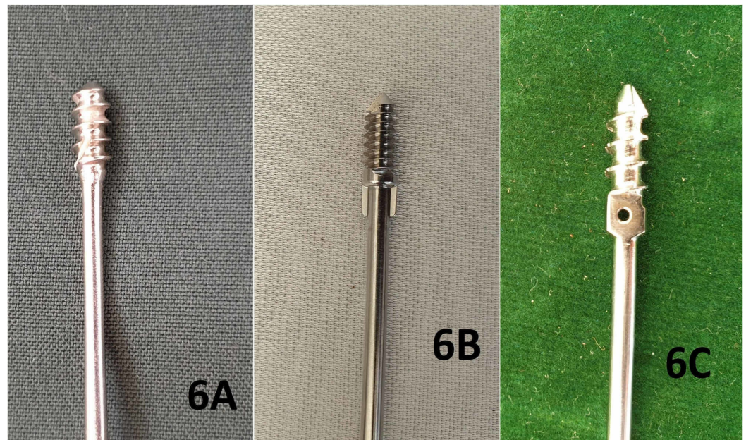
FIGURE 6: Comparison of the designs of three different Fassier-Duval nails

Figures 6A, 6B, and 6C show the profile and features of the tips of the male rods manufactured by Universal Orthosystems, Pega Medical, and Uma Surgicals respectively