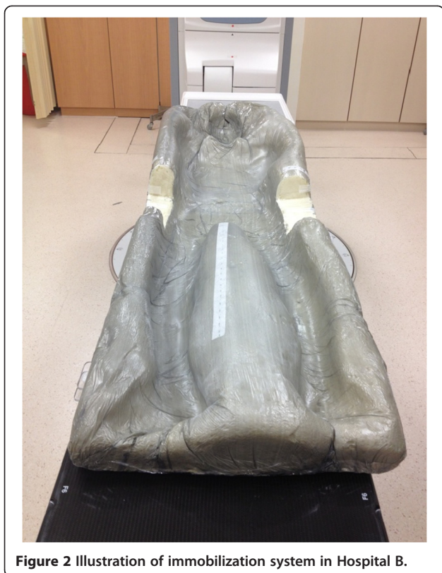
Figure 2 Illustration of immobilization system in Hospital B.

cut-out treatment window, a Styrofoam Feetfix and a tailor-made aquaplast sheet. The aquaplast sheet, which was a synthetic polymer [25], was heated to 77-81°C in a water bath. Due to its malleability after heating [16], the pliable sheet was then stretched and moulded to conform to the patient's external contours from waist to upper thigh. The sheet was locked into the baseplate on two lateral sides and between patients' thighs. It was then allowed to cool down and harden. The baseplate was not indexed to the couch. The Feetfix was used to assist in securing the lower legs, while a foam pad was used to ensure patient comfort.