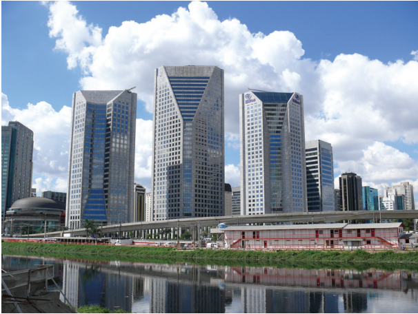
FIGURE 1: Pinheiros River in São Paulo. The Pinheiros River as the Tiete River in Sao Paulo passes through the inner part of the city and is heavily polluted. Pinheiros River is largely anaerobic and heavy methane formation can be observed. In 2008 further down of this place at station PINH 04900 a mean conductivity of 480 \mu\text{S cm}^{-1} , 18.67 \text{ mg l}^{-1} ammonium, 55.7 \text{ mg l}^{-1} BOD5 and 1,100,000 thermotolerant coliforms per 100 ml have been measured; data taken from the CETESB report 2009 [16].

Standard Method for the Examination of Water and Wastewater [14]. The application of such a procedure revealed a severe impact of urban activities dependent on the quality of water treatment on the trophic status of a river [15].