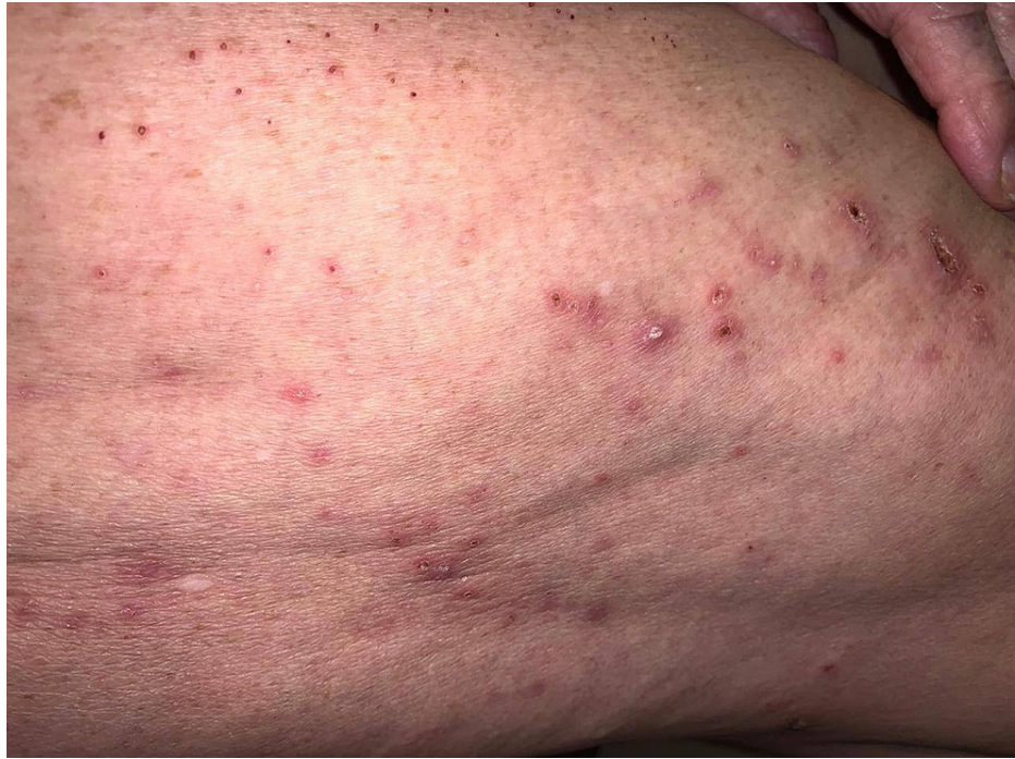
FIGURE 2: Erythematous excoriated papule followed the anti-scabietic treatment.

In the emergency room, the patient became hypotensive, and the team started her on intravenous normal saline (500 cc). Her laboratory investigations revealed high creatinine, potassium, and lactic acid levels. Other results from her laboratory investigations were unremarkable. The patient did not respond to fluid management, leading the treating team to suspect septic shock. After consulting with the intensive care unit (ICU) team, her care team admitted her to the ICU.